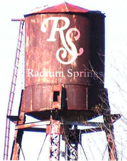
Radium Springs Neighborhood

TO: Board of Commissioners of Dougherty County